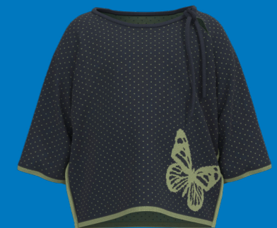
3D render made in CLO

Exported shapes and images can be used in any external 3D simulation software to check the fit and design before knitting.