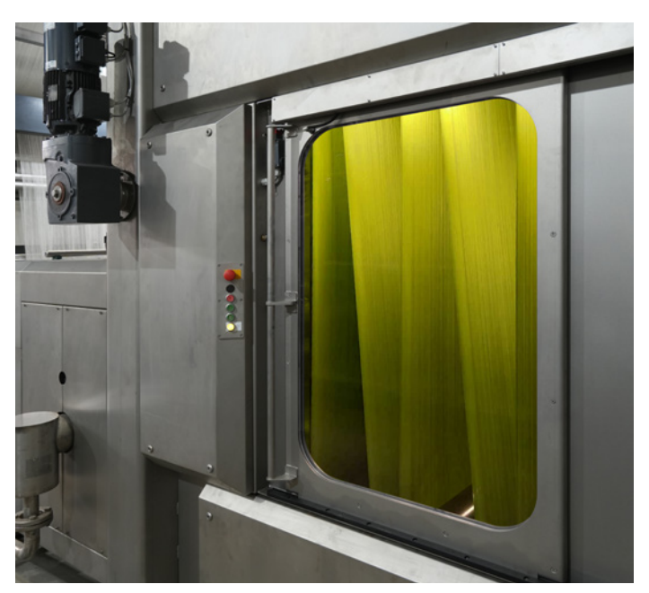
NOX – nitrogen reactor

Working width No. of beams 8 to 20 Up to 50 m/min 40 to 45 2,000 L 13 m³