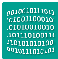
Data storage and recipe administration 数据储存和工艺管理