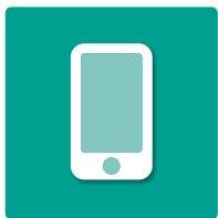
Connect app available 可使用卡尔迈耶连线App