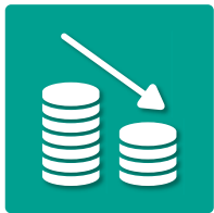
Low maintenance costs 较低的维护成本