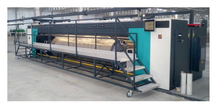
Headstock BM-D (with cross-motion device)

Even the heaviest beams can be doffed by one button operation.