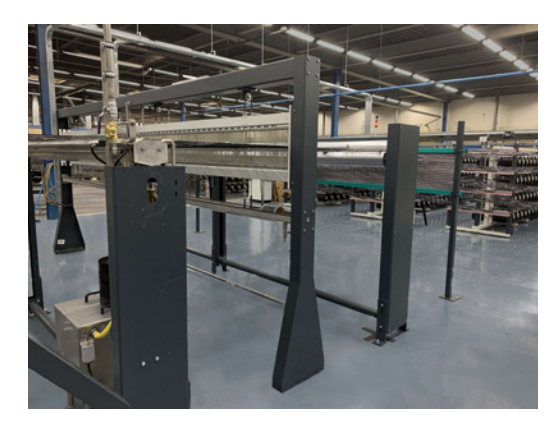
Leasing device with heddles and auxiliary equipment