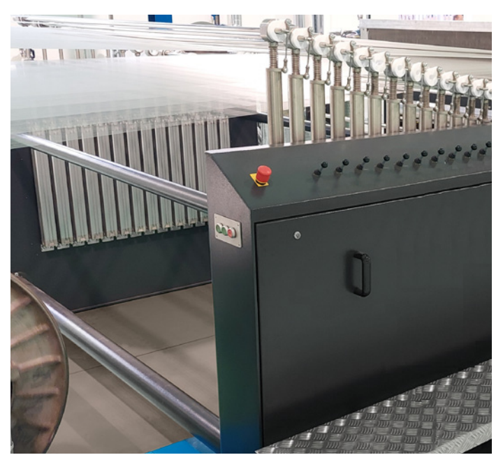
Newly designed leasing device (pneumatic)