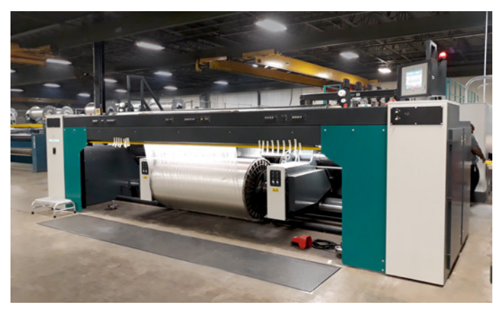
Headstock to assemble the filament yarns