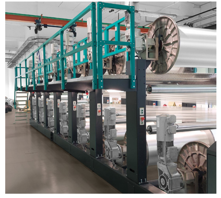
Newly designed ergonomic beam creel