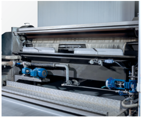
Large sizing filters easy to inspect and clean